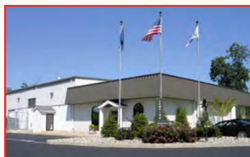
Biotech Research & Resource Center Pipersville, PA

To discuss any of our Contract Manufacturing services contact our Operations Staff at 215-766-4901, or to inquire about any other of Lampire's offerings, please call us at 215-795-2838 or email lampire@lampire.com.